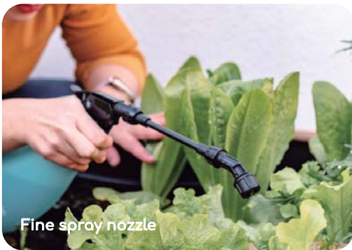
Fine spray nozzle

If you don't need it you can remove it and use the fine spray nozzle instead.